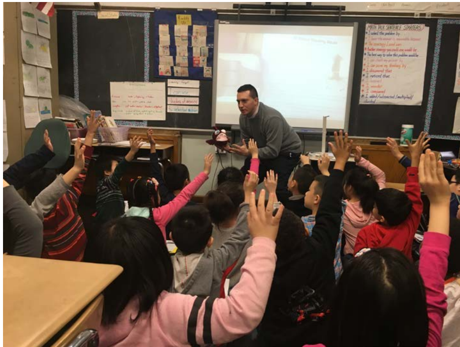
Realia may help spark student interest and bring high-level academic words to life.